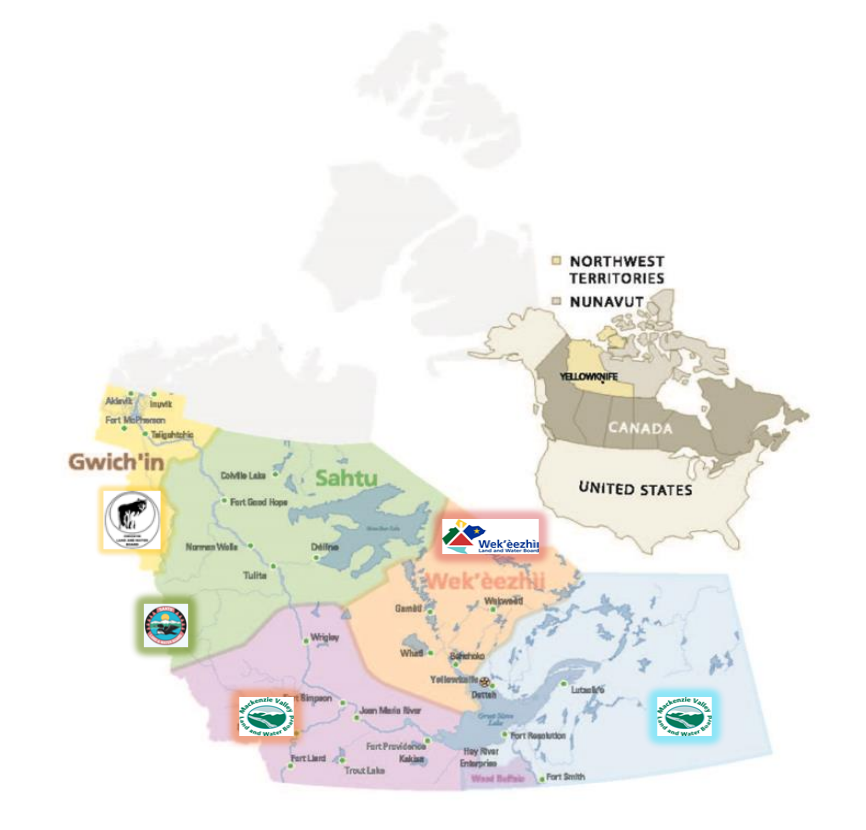
Figure 1: Map of the Northwest Territories showing the regions where the land and water boards of the Mackenzie Valley operate.

Water Board - regulate the use of water and the deposit of waste by way of licences. Currently, the Mackenzie Valley Land and Water Board (MVLWB) is also responsible for managing areas of the NWT that do not yet have land claim agreements as well as transboundary requirements, ensuring that policies within the Mackenzie Valley are consistent.