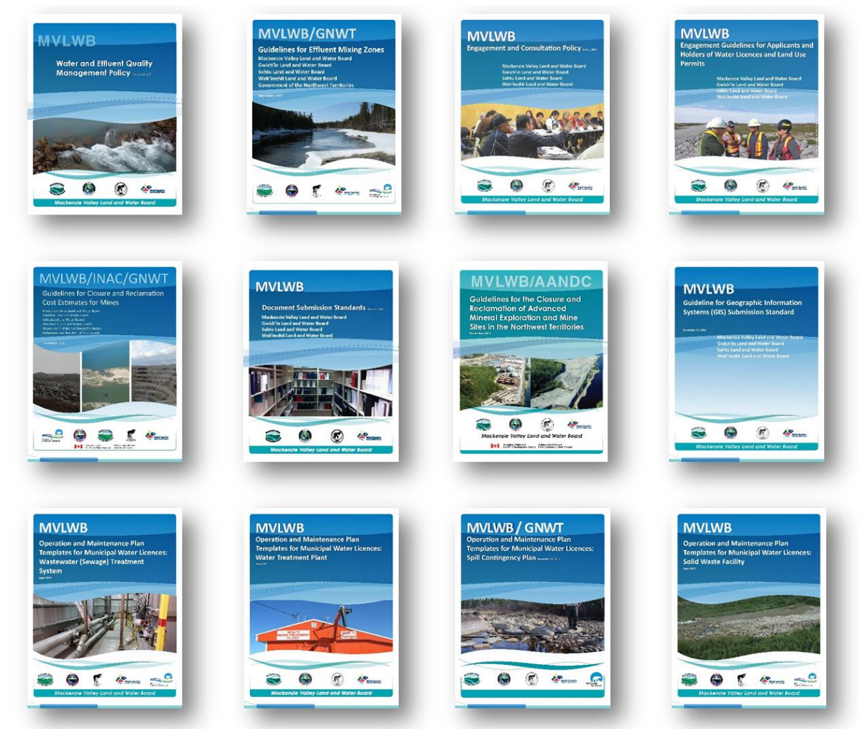
Figure 3: Samples of policy and guidance documents prepared by the Land and Water Boards (in some cases, jointly with the Territorial and Federal governments.

Some of the Policies and Guidelines that assist the boards in fulfilling their mandates are listed in Figure 3 below: